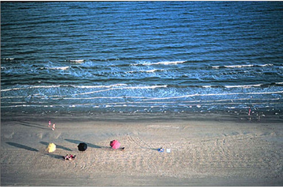
Galveston is a small romantic island 32 miles long and 2 1/2 miles wide, possessing all the charm of a small southern town